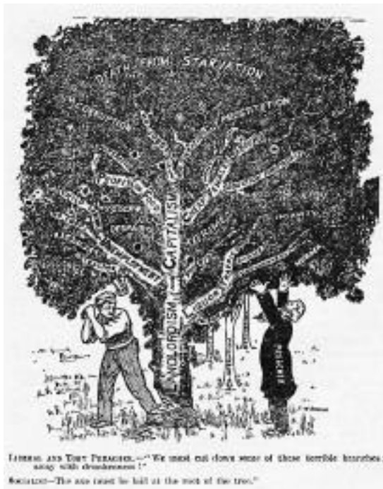
FERRIS AND THE FERRIS.—"We took out some more of those terrible horrors; and, with a few more!" BOSTON.—"The axe went to bed at the root of the tree."

'Did ye feel a draught coming in during the night?'